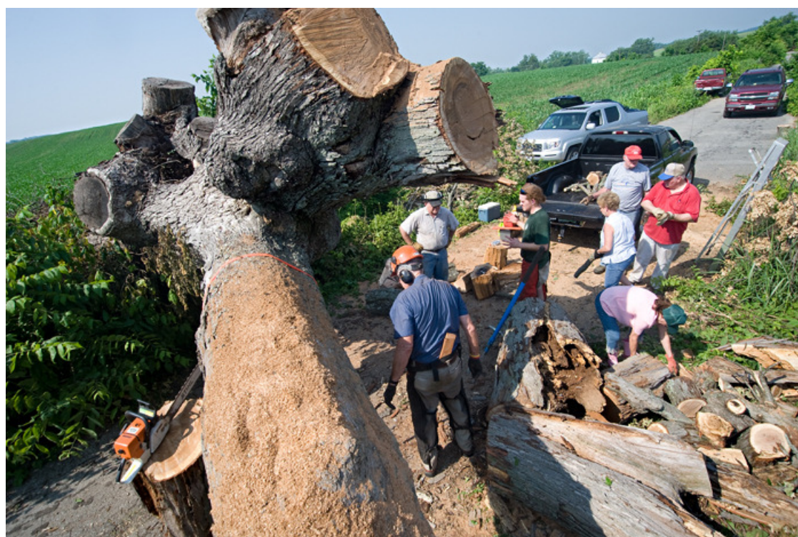
Members of the Woodturners of the Virginias load pieces of the fallen Jackson Prayer Tree to haul away. Ironically, the white oak that became known because of a Southern general toppled over to the north.